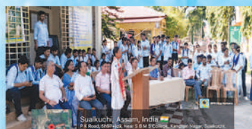
Photo : Pre-election open debate fostering democratic dialogue among student candidates

Democracy at Doorstep: The Student Union Election for the academic year 2025–26 was conducted on 17 October, 2025 in a free, fair, and peaceful manner on the college campus. The election witnessed active student participation, reflecting strong awareness of democratic values and civic responsibility.