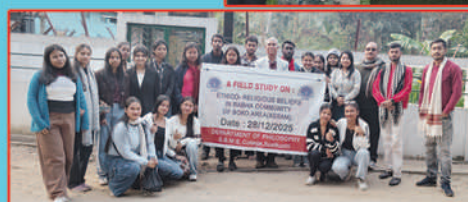
Photo : Field Trip to Mawkhlang Village by Deptt. of Philosophy on 28-12-2025