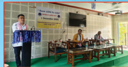
Photo : Observance of World AIDS Day at S.B.M.S. College to promote HIV/AIDS Awareness

● The NSS Unit of S.B.M.S. College organised a Cleanliness Drive at Balichar, Sualkuchi on 6 December 2025 as part of its ongoing community engagement initiatives. The activity aimed at promoting cleanliness, environmental awareness, and social responsibility among students and the local community.