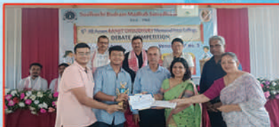
Photo : Winner of the First Prize at the 8th All Assam Ranjit Choudhury Memorial Inter-College Debate Competition.