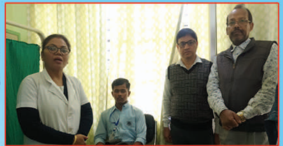
Photo : Students and organisers during the TD Vaccination Programme.

Awareness on Food Safety: An awareness programme on food safety was organised at the college campus on 30 December, 2025, to create awareness among students about food hygiene and the importance of maintaining food safety standards.