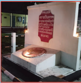
Photo : Paying tribute to martyrs through the lighting of the ceremonial lamp on Swahid Diwas on 10 Dec, 2025.

Swahid Diwas was observed at S.B.M.S. College on 10 December, 2025 with solemn respect and reverence to the valour and sacrifice of the martyrs of Assam Agitation (1979-1985). The programme included the lighting of the ceremonial lamp to pay tribute to the martyrs and to honour their supreme sacrifice.