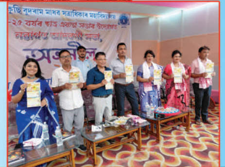
Photo : Inauguration of the Annual Newsletter of the Department of Zoology 'Mou' during ABHRANEEL, 2025