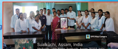
Photo : The Department of Assamese observing Lakshminath Bezbaruah Jayanti