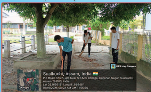
Photo : Students participating in the Cleanliness Drive on the college campus

● A Cleanliness Drive was conducted at the college campus on 1 October, 2025 prior to the reopening of the institution after the Durga Puja vacation. The initiative witnessed active participation from students, promoting cleanliness, hygiene, and civic responsibility.