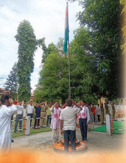
Photo : Celebration of Independence Day