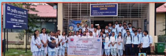
Photo : World Savings Day Observance