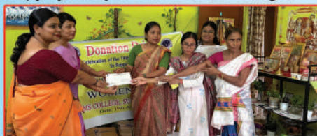
Photo : Women Cell, SBMS College during Donation Drive

Quality Testing of School uniform samples from Hajo Block of Kamrup: The Department of Chemistry, S.B.M.S. College, conducted uniform testing of school uniform samples from Hajo Block of Kamrup on 18 and 19, December 2025. The activity was carried out as part of the Department's outreach and laboratory services to ensure quality assessment and compliance with prescribed standards.