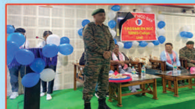
Commanding Officer interacting with NCC cadets during NCC Day observance at S.B.M.S. College

● NCC Day was observed at S.B.M.S. College on 28 November, 2025 with the visit of the Commanding Officer, who, interacted with the NCC cadets. The interaction highlighted the values of discipline, leadership, and service to the nation.