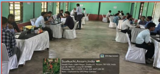
Photo : On-spot interviews conducted during the Recruitment Drive at SBMS College