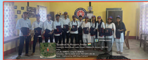
Photo : NSS volunteers after the Cleanliness Drive at Balichar.

● The NSS Unit of S.B.M.S. College organised a Cleanliness Drive at Balichar, Sualkuchi on 6 December 2025 as part of its ongoing community engagement initiatives. The activity aimed at promoting cleanliness, environmental awareness, and social responsibility among students and the local community.