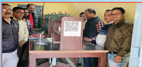
Photo : Uniform Testing by Department of Chemistry, SBMS College

Quality Testing of School uniform samples from Hajo Block of Kamrup: The Department of Chemistry, S.B.M.S. College, conducted uniform testing of school uniform samples from Hajo Block of Kamrup on 18 and 19, December 2025. The activity was carried out as part of the Department's outreach and laboratory services to ensure quality assessment and compliance with prescribed standards.