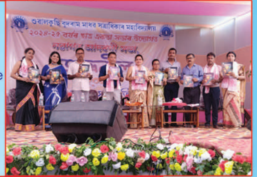
Photo : Dignitaries inaugurating the Annual College Magazine "ARUNABH."