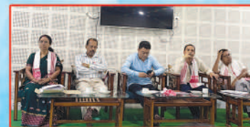
Photo : Annual General Meeting of S.B. M. S. Multipurpose Co-operative Society held on 26 Sep., 2025