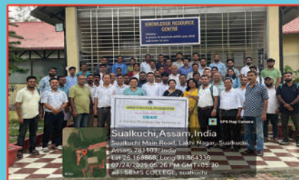
Photo : Workshop on College E-Administration & AI