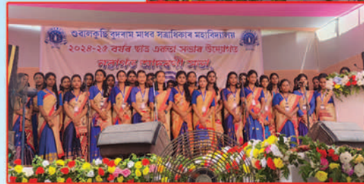
Photo : Students performing a chorus at ABHRANEEL 2025.