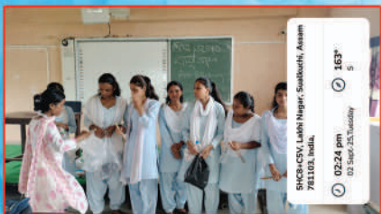
Photo : Students during Eco-Brick Hands-on Training (Botany Dept.)

The programme was organised by the Department of Botany for the students of VAC- EVS . The programme, conducted by the Akshar Foundation Team, sensitised students to the importance of plastic waste recycling and the adoption of eco-friendly solutions to address environmental challenges.