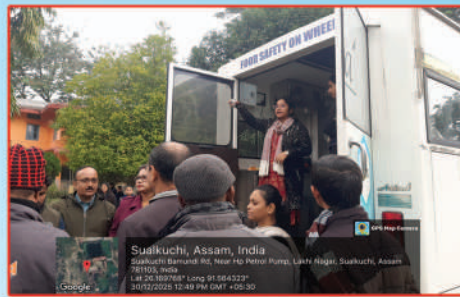
Photo : Food Safety Awareness session for students by the Food Safety Department, Kamrup District in collaboration with S.B.M.S College.

Awareness on Food Safety: An awareness programme on food safety was organised at the college campus on 30 December, 2025, to create awareness among students about food hygiene and the importance of maintaining food safety standards.