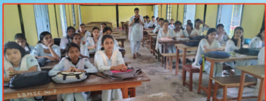
Photo : Special Classes by Alumni for HS 2nd Year Students

Special Classes: For Higher Secondary Second year students during the summer vacation 2025, facilitated by alumni of the college as a part of the alumni engagement.