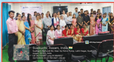
Photo : Faculty members, students, and invited guests during the Philosophy Day programme at S.B.M.S. College.