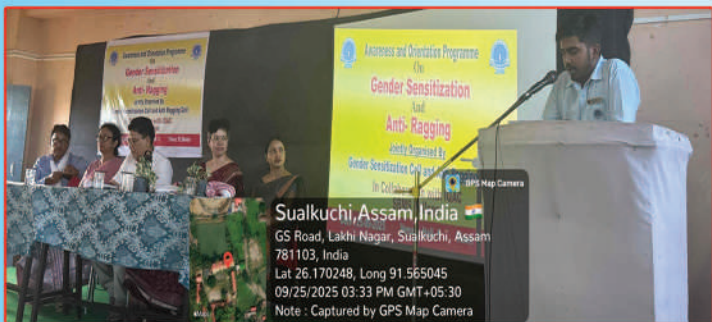
Photo : Awareness and Orientation Programme on Gender Sensitisation and Anti-Ragging in progress.