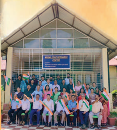
Photo : Flag hoisting ceremony led by the Principal during celebration of 79th Independence Day on 15th Aug, 2025.