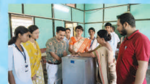
Photo : Election Day