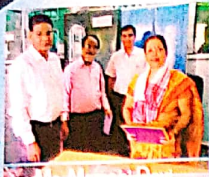
HOD & Associate Professor, Dept. of Political Science formally assumed office as Vice Principal.